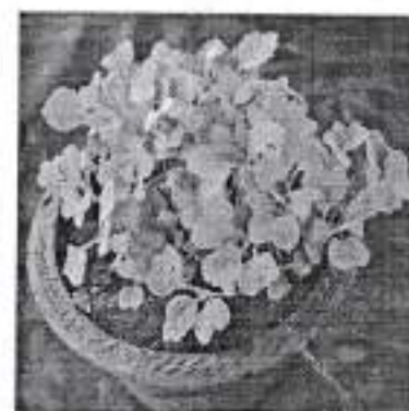
Treated Seeds of Cabbage