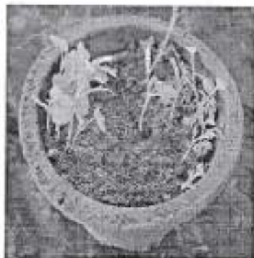
Untreated Seeds of Cabbage