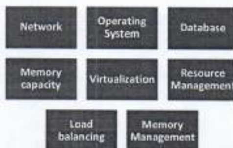
Figure 2: Technologies involved in cloud computing that can affect the data security

Various key factors can affect the efficiency of cloud computing because it is surrounded by various technologies such as load balancing, network, competition control, virtualization, operating system, database, memory management, etc. (Qadiree & M, 2016) Figure 2.